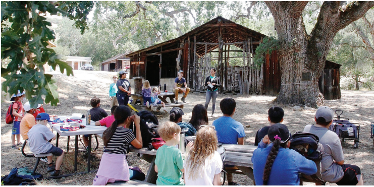
CFCV grantee, UC Berkeley Hastings Reserve, provides environmental education in Cachagua