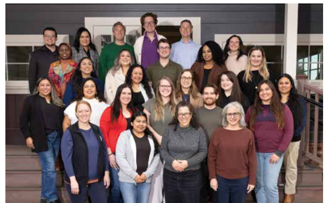
2026 LEAD Cohort gathered at the Harden Foundation in Salinas

This year’s LEAD cohort features nonprofit professionals from diverse fields of nonprofit activity, including vital safety net agencies meeting essential human needs. The 2026 class includes participants from nonprofits based in Monterey, San Benito and Santa Cruz counties. They join a