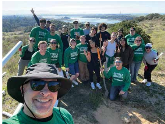
Elkhorn Slough Foundation volunteers

In 2025, the Community Foundation for Monterey County (CFMC) proudly granted a record $51.9 million to strengthen and uplift our community. These funds were made possible through donor advised funds, Monterey County Gives! and charitable funds established by generous individuals, families and businesses.