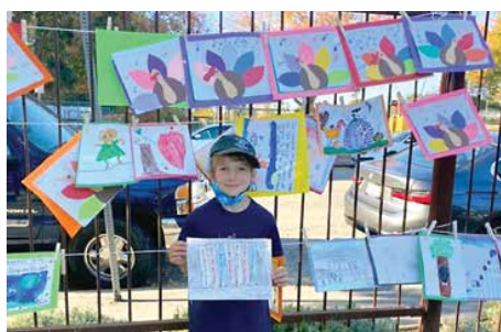
Carmel Valley Art Association received a CFCV grant for free children's art workshops

The CFCV granted $27,000 in response to the 2023 floods and an additional $24,500 through its 2023 annual grantmaking to ten nonprofits focusing on projects and programs benefiting the communities surrounding Carmel Valley. Recipients included the Breast Cancer Assistance Group of the Monterey Peninsula; Cachagua Fire Protection District; Carmel Valley Art Association; Carmel Valley