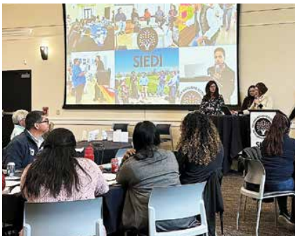
Partners shared progress at the SIEDI convening in October

The Salinas Inclusive Economic Development Initiative (SIEDI) has made a difference working and advocating for family sustaining jobs and a more inclusive and equitable economy for the communities of the Salinas Valley. Thanks to a generous $3,350,000 million grant from The James Irvine Foundation the program will continue.