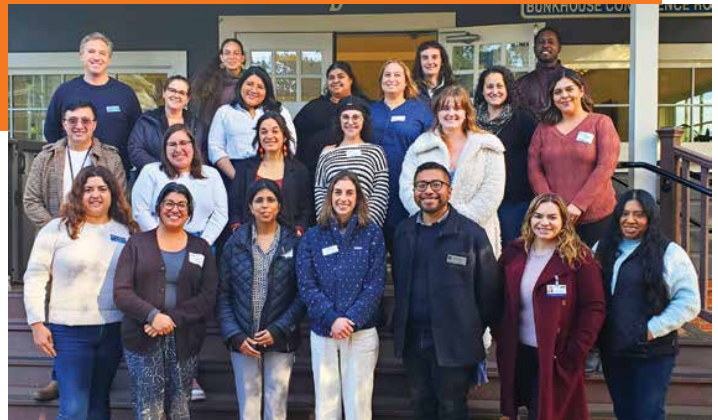
LEAD Institute 2024 cohort gathered in February at the Harden Foundation