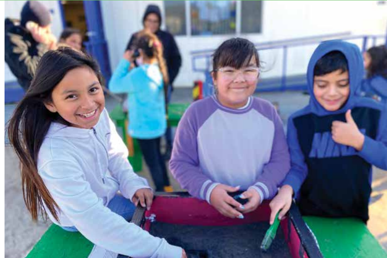
CFMC grantee Greenfield Community Science Workshop

More than $15 million of the total grants came from donor advised funds, through which people support a wide range of causes. Proceeds from the annual Monterey County Gives! campaign accounted for $10.9 million of the total. Monterey