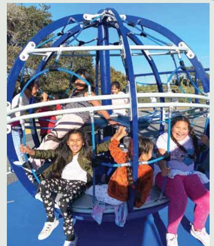
CPY creates positive experiences for local youth