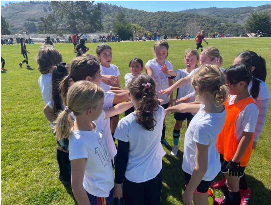
Monterey Condors Club participants